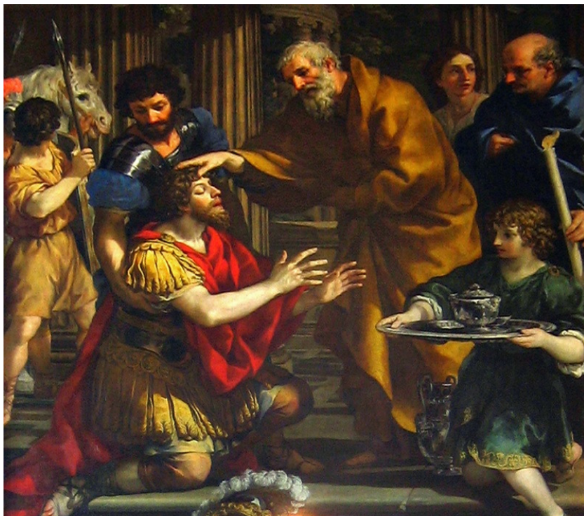
"Ananias restores sight to St Paul" By Pietro da Cortona (1596-1669)